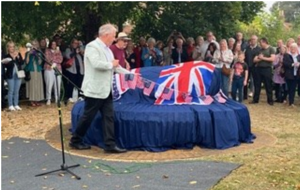
Lord John Mann unveils the sculpture