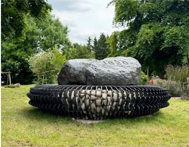
The Rock in place on the Croft